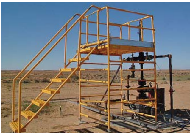
Custom builds available on request